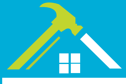
First home is completed in Dania Beach