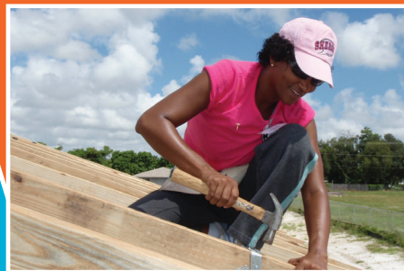
Women Build program is founded